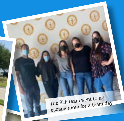
The BLF team went to an escape room for a team day