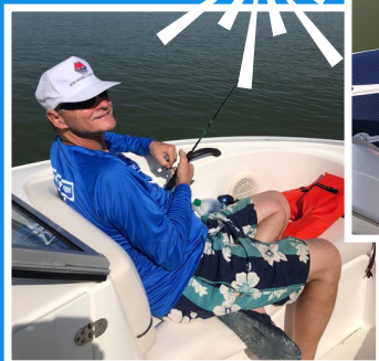
My dad fishing