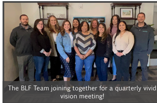
The BLF Team joining together for a quarterly vivid vision meeting!