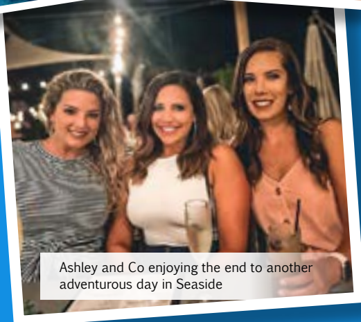
Ashley and Co enjoying the end to another adventurous day in Seaside